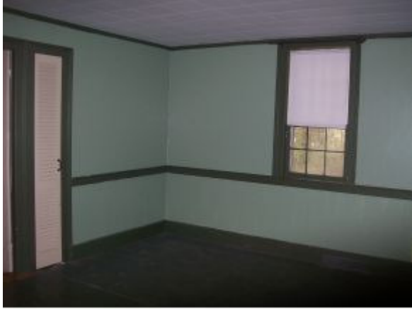
front room of cape