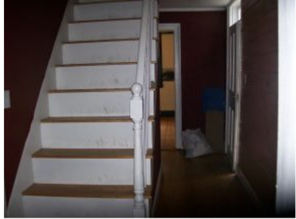
hall way toward office