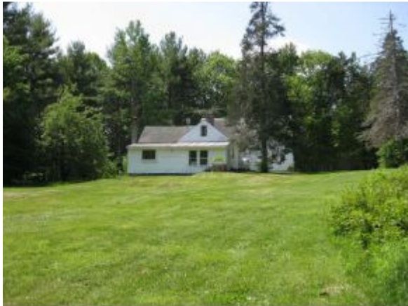
field behind house