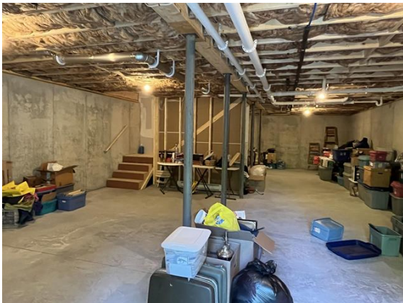
Full Basement ~ Walk-Out