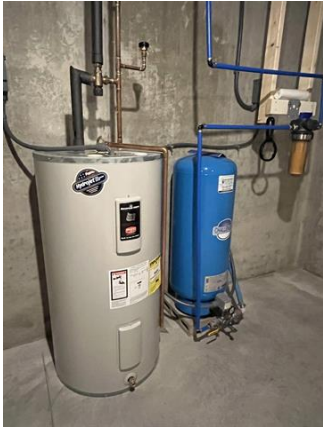
50 Gallon HWH ~ Electric