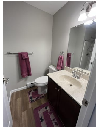
Pvt. en suite Bathroom