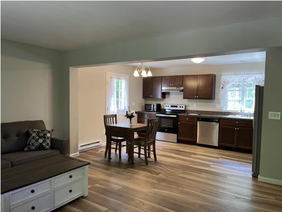
View from Lv.Rm to Kitchen