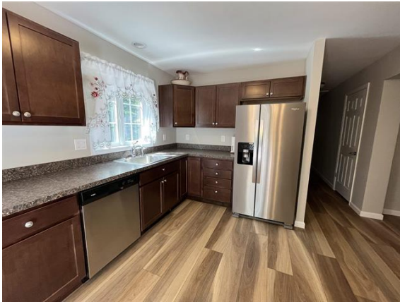
Stainless Steel Appliances