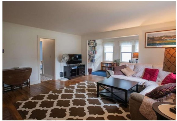
The front door opens into a spacious living room