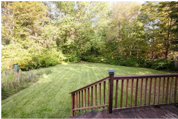
Your own oasis, walking distance to town