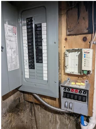
Updated electrical and generator panel