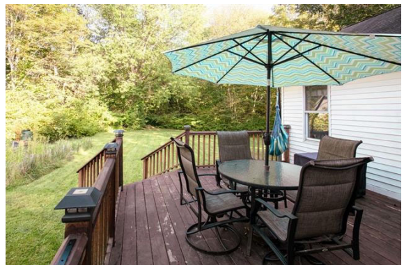
Enjoy cocktail hour and dinner on the back deck