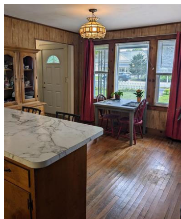
Grab a quick bite or sit down more formally for meals

Subject to errors, omissions, prior sale, change or withdrawal without notice. Users are advised to independently verify all information. The agency referenced may or may not be the listing agency for this property. PrimeMLS is not the source of information presented in this listing. Copyright 2023 PrimeMLS.