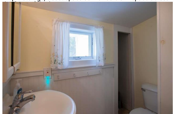
Upstairs bath with mini closet