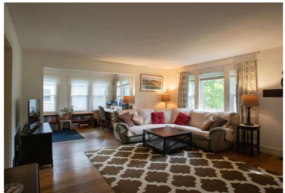
Light and airy living space