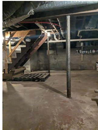
Basement has sump pump and peripheral trench drains