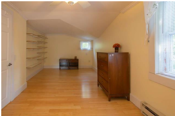
Wide enough for a queen with 2 nightstands or king without