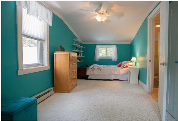
Second upstairs bedroom