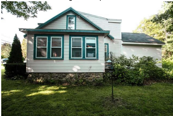
Exterior of sunroom...a great place to birdwatch