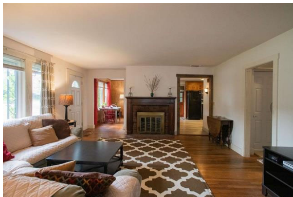
Functional woodburning fireplace makes living space cozy