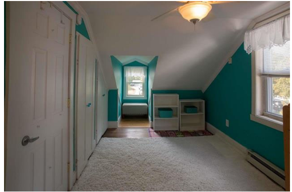
Cute closets and plenty of crawl space for storage