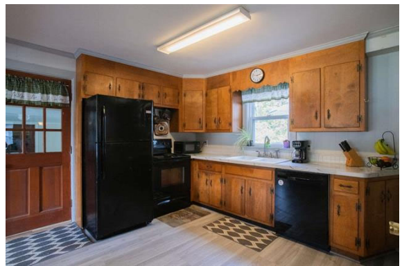
Kitchen with all-wood cabinetry