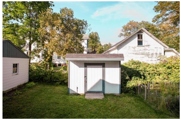
Shed has plenty of space for your generator, snow blower and lawn mower