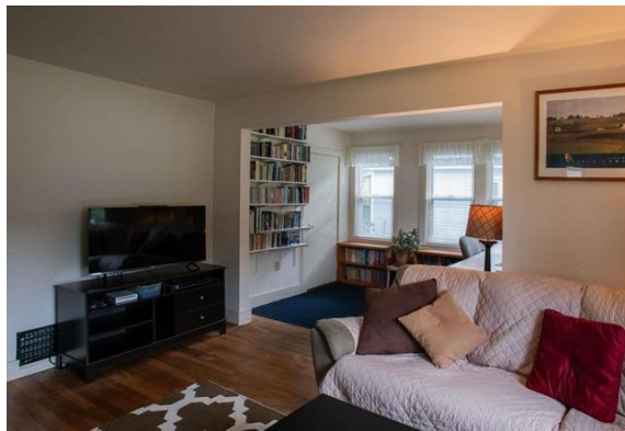
A sunroom or office with a large closet off the living room