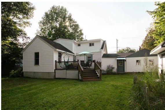
Rear of home