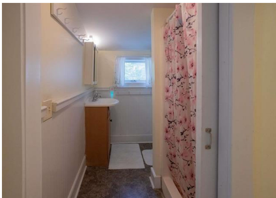
Upstairs bath with a quaint pocket door