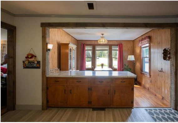
Additional storage and convenience for meals