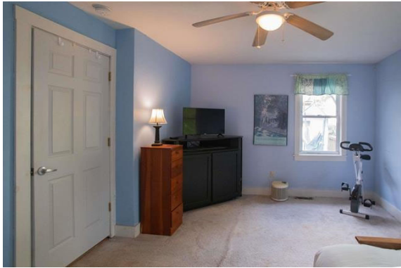
Spacious bedroom provides flexibility...furniture or gym equipmet, you choose