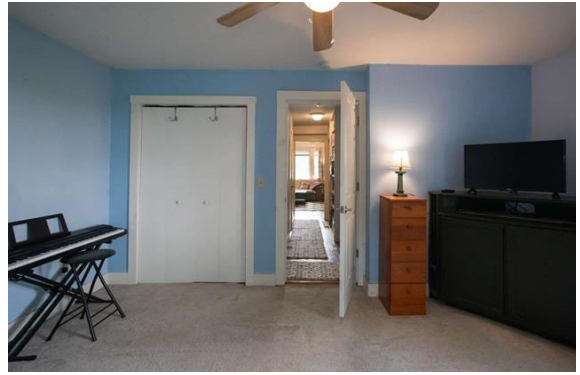
Plenty of closet space