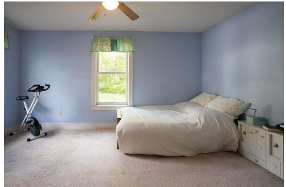
Downstairs bedroom overlooks peaceful back yard