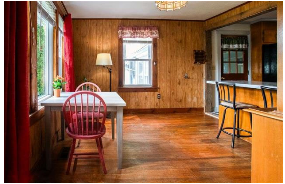
Enjoy the view while dining