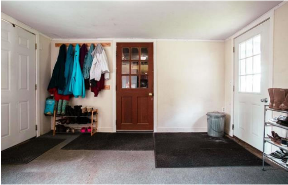
Breezeway/mudroom with plenty of space for coats and shoes