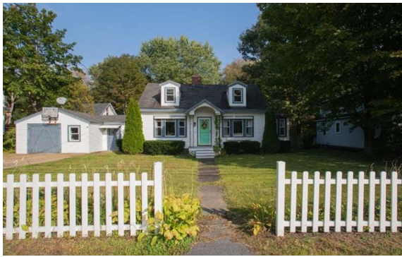
Welcome to 94 Court Street in Exeter