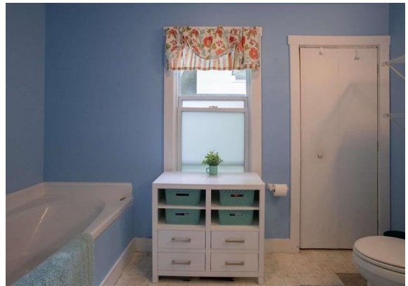
Tub and ample closet space in downstairs bathroom