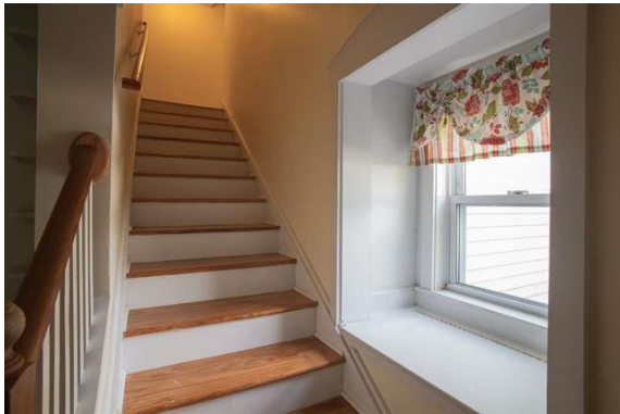
A fun reading nook with a great outdoor view