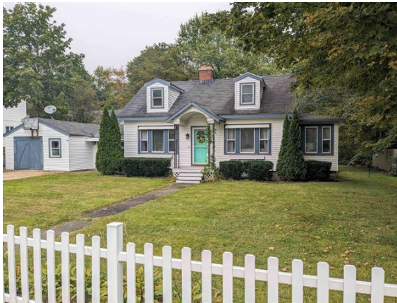
Adorable even on a cloudy day