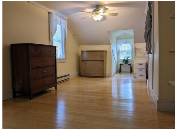
Great light from dormers and ceiling fan