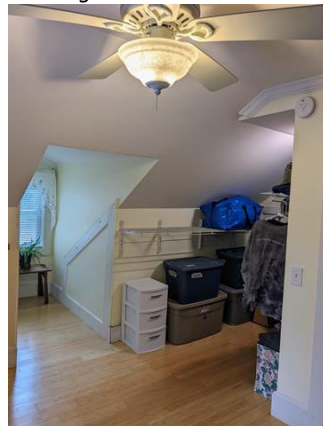
Ample storage/closet space as well as crawl space across