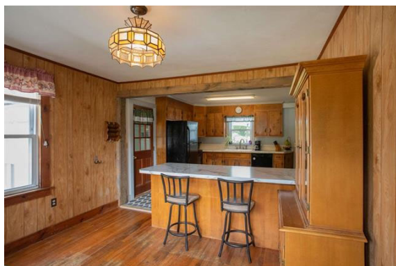
Breakfast bar in the kitchen/dining area