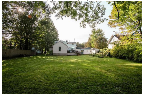
Plenty of yard for gardening or entertaining