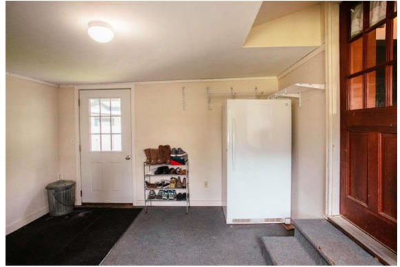
Use the space for driveway salt/sand or an extra freezer