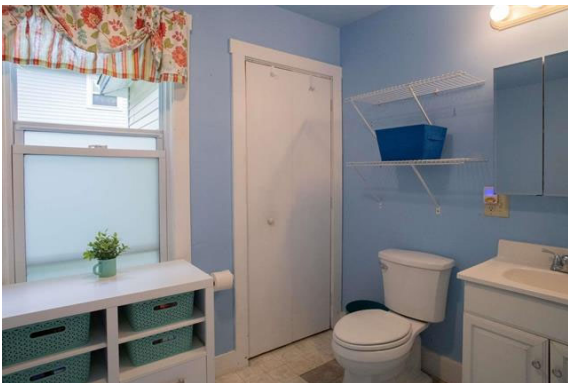
Natural light and fresh air in the bathroom