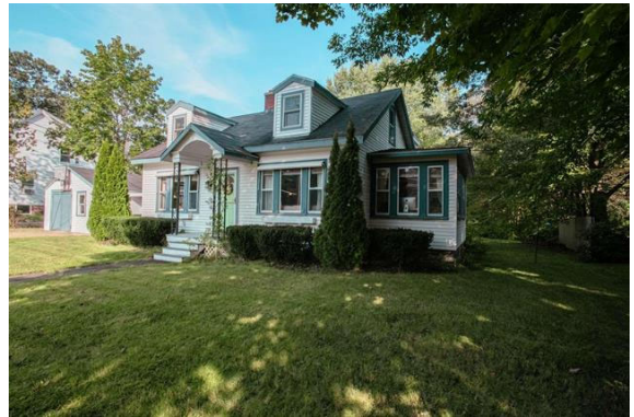
94 Court Street...just right!