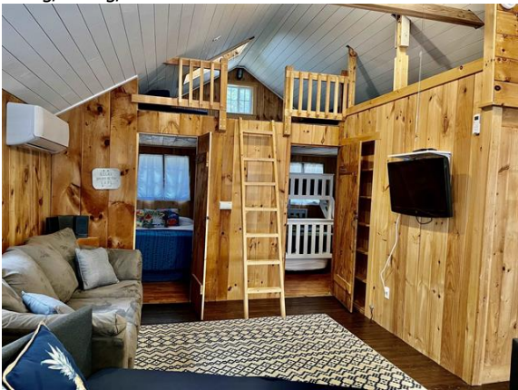
2 Bedrooms & Loft