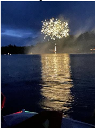
4th of July