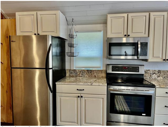
Stainless Steel Appliances