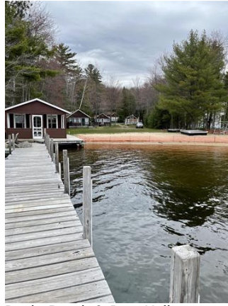
Dock, Beach & Rec. Hall