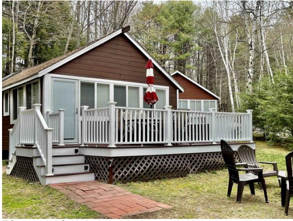
7Greenwood, Unit 4