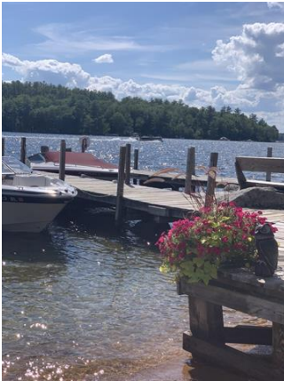
Dock - Waiting List