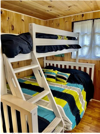
1Full & 1Twin Bunk Beds