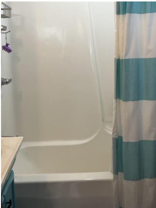
Tub & Shower