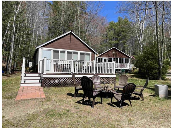
7 Greenwood "Unit 4"