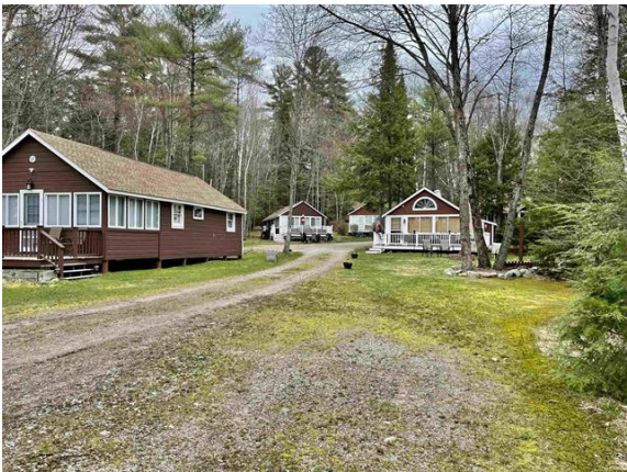
View from the Beach