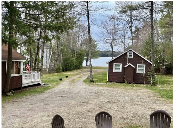
View from the Cottage

Subject to errors, omissions, prior sale, change or withdrawal without notice. Users are advised to independently verify all information. The agency referenced may or may not be the listing agency for this property. NEREN is not the source of information presented in this listing. Copyright 2022 Northern New England Real Estate Network.