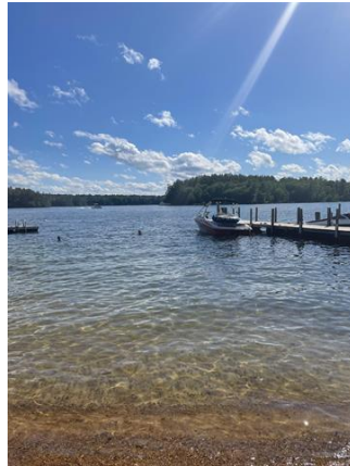
Private Sand Beach