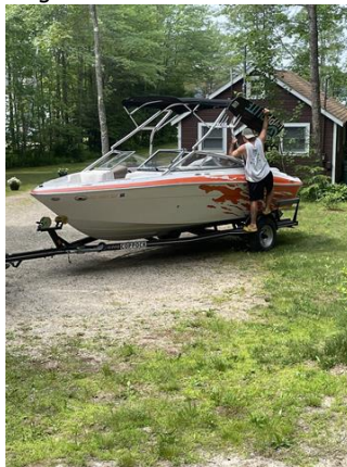
Launch 1/3 mile