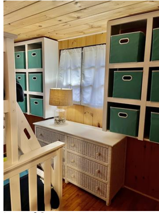
Lots of Storage