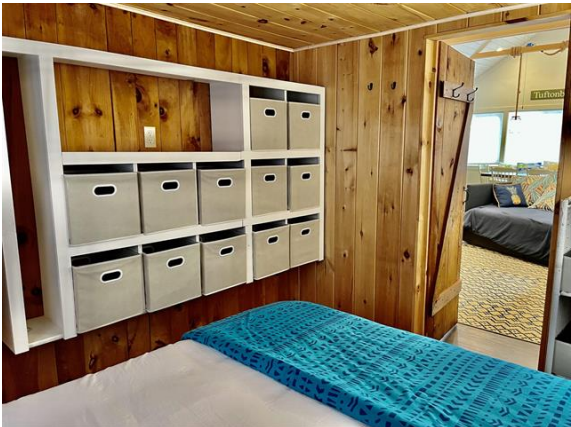
Storage Bins & Sm. Closet