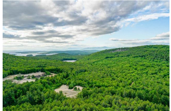
51-1 and 51-2