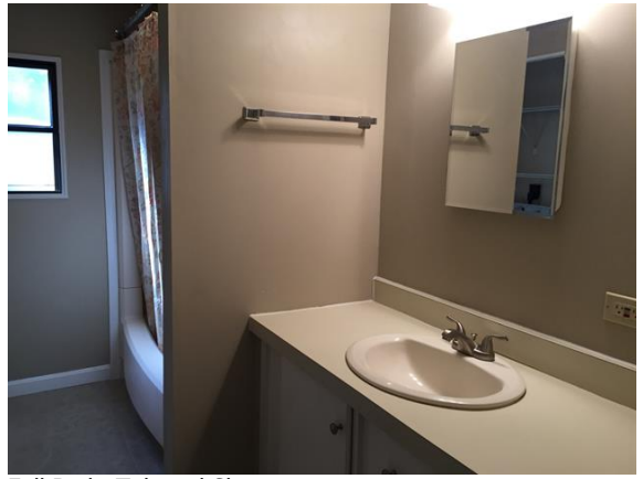
Full Bath, Tub and Shower