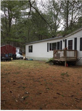
View to Street