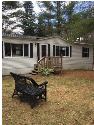
Side view of Front Door

Subject to errors, omissions, prior sale, change or withdrawal without notice. Users are advised to independently verify all information. The agency referenced may or may not be the listing agency for this property. NEREN is not the source of information presented in this listing. Copyright 2021 New England Real Estate Network.