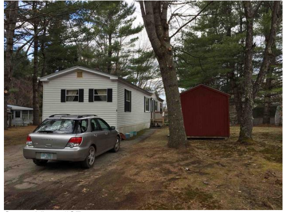
Street View #37