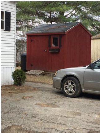
New Storage Shed