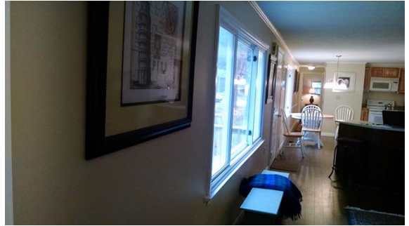
View toward kitchen