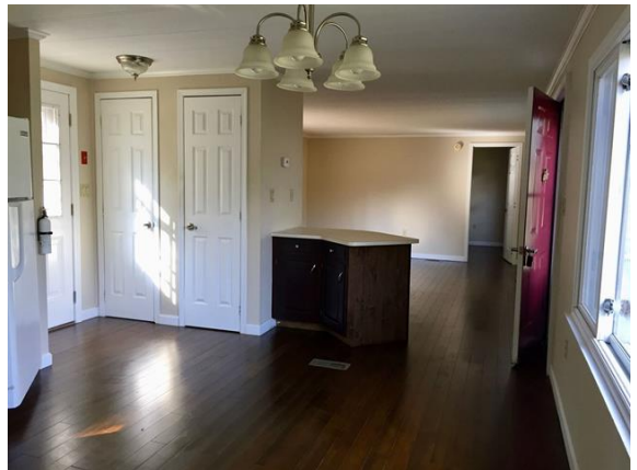
View from Kitchen to Living Rm.