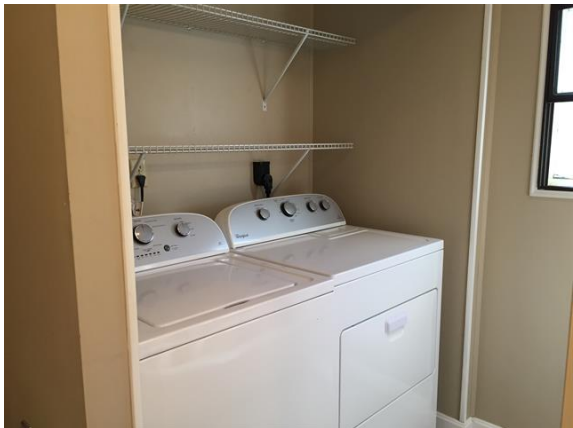
Laundry area in Full Bath