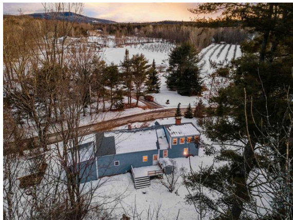
Apple Picking at neighboring farm