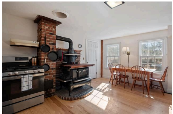
Sunny Eat In kitchen