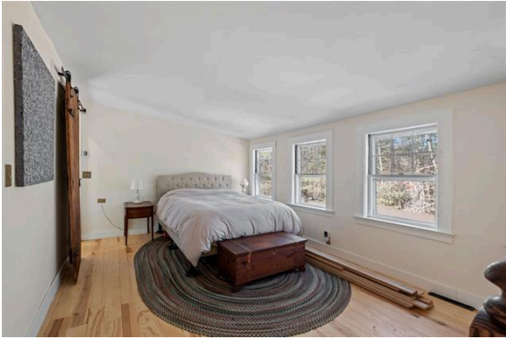
Primary Suite level 2