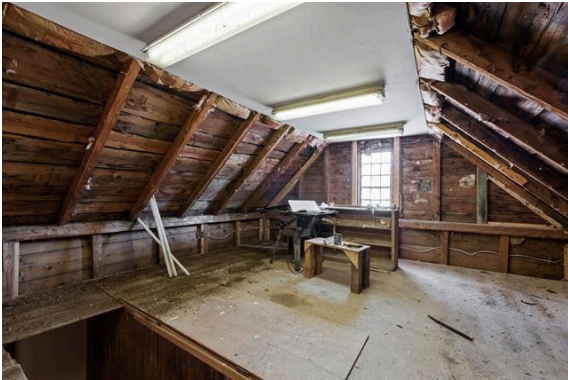
Upper Area of Barn/workshop