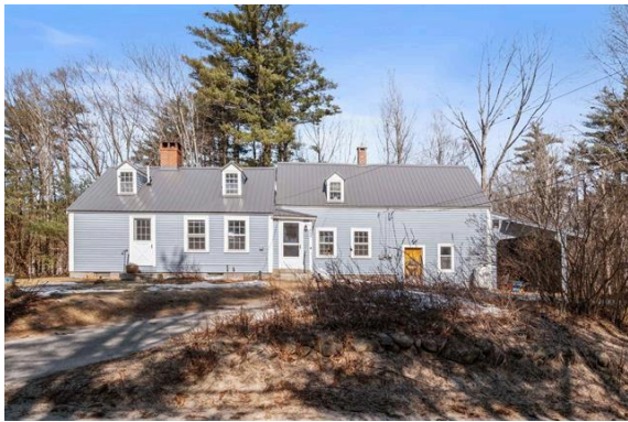
Freshly painted exterior