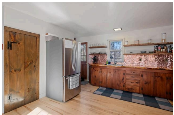
Access to back deck off kitchen