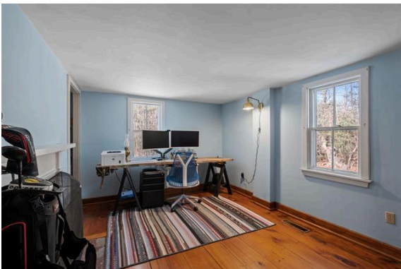
1st Floor Bedroom