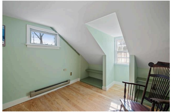
Bonus Area off Primary Suite