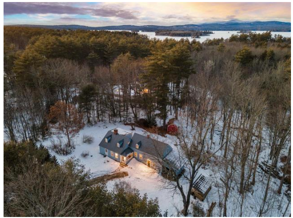
Lake Wentworth in the distance