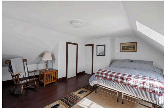
2nd Level Bedroom